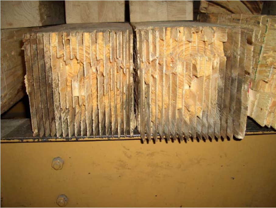
Figure 6 Damaged general finger joint of upper glulam girder due to water penetration (figure is presented upside down!)

technology at the time [gluing secured by nails was and is limited to a board thickness of max. 35 – 50 mm]. The production of the vertical general finger joints of the web-boards must also be regarded as difficult and not very robust. The quality of the glue lines in these finger joints of the webs differed. Added to this was prior damage to the large-format web-boards due to changing humidity exposure. These structural defects were involved in causing the collapse of the arena.