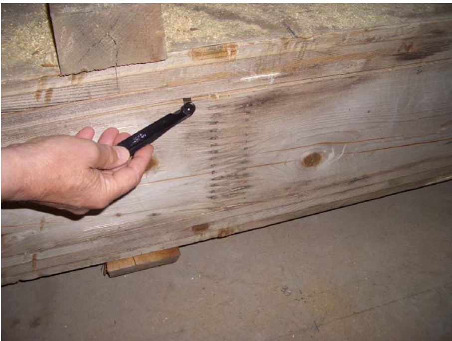
Figure 8 Damaged glulam-girder to web-board glue line

A professional examination of the structural integrity of the roof structure is not documented. With this, it should have been taken into account that it involved a special structure. Furthermore, even years ago, indications must already have existed for damage to the glue lines between glulam-girders and web-boards, as well as to the general finger joints of the lower girders and the general finger joints of the web-boards. For a professional, this should have given rise to a more detailed examination of the condition of the roof structure and the related technical documentation.