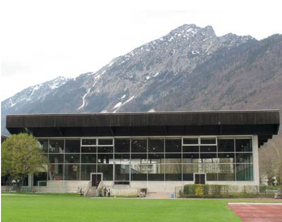
Figure 1 Ice-arena in Bad Reichenhall

The Bad Reichenhall ice-arena, built in 1971/1972, was a structure of approx. 75 m in length and approx. 48 m in width. The roof was supported by 2.87 m high main girders, which were produced in timber construction as box-girders. It was a special type of construction. The box-girders were produced with upper girders and lower girders made of glulam and lateral web boards made in a so-called “Kämpf web board” [a type of X-lam], whereby the 48 m long girders were produced out of three 16 m long sections, which were joined with general finger joints. For the “Kämpf web-girder” type of construction, a general technical approval was available, which, however, limited the building height of the web-girders produced in this manner to 1.20 m.