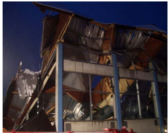
Figure 2 Partial view of the collapsed roof structure