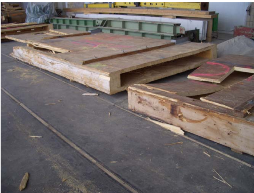
Figure 5 Box-girders with Kämpf web-boards with h = 2.87 m

With the ice-arena in Bad Reichenhall, significant regulations in the technical approval for the Kämpf web-girder construction were violated and the scope of experience at that time was abandoned. In particular, the maximum girder height of 1.20 m according to the approval was far exceeded in the construction of the Bad Reichenhall ice-arena, with a girder height of 2.87 m. An applied-for extension of the approval to the planned type of construction with box-girders without a height limit was not granted by the German Institute for Building Technology in 1971. Therefore, a so-called “Approval for an individual case” by the Supreme Building Authority of the Free State of Bavaria for executing the special structure would have been necessary. According to the findings to date, such an approval was not applied for by those involved in construction and was not available.